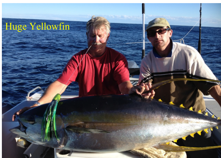
Blue, Black & Striped Marlin, Bluefin, Yellowfin, Bigeye Tuna, Albacore, Wahoo, Shortbilled Spearfish, Dolphinfish, Sailfish, Mackerel, Kingfish and more have felt the bite of the "Dingo".